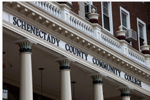
Schenectady County Community College in Schenectady, N.Y.