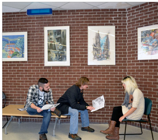
A GLO upper air fixture from UV Resources (above) disinfects the air in the student lounge at Schenectady County Community College.

Some areas at the college are multileveled, however, so units were strategically placed to avoid exposure to the students. Other areas, like the elevators, were avoided for fear that students would purposely try to access the lamps without realizing the danger of direct UV-C exposure. “Teenagers don’t always think about consequences, so we wanted to avoid any possibility of harm,” explains Yauney.